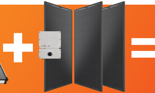
SOLAHART SOLAR POWER (5kW and above)